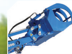
PARALLELOGRAM LOADER OPTION